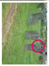
Muchovela's Grave To Helston (B3297)