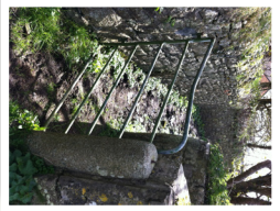
Gate beside Wendron Church