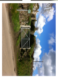
Wendron Stoves sign