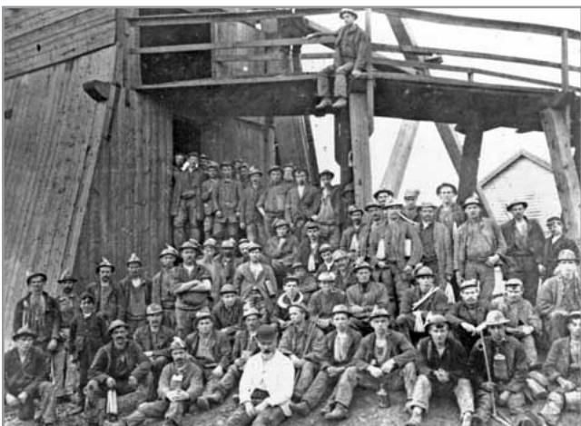
Miners at Wheal Friendly.

In 1907, a dressing floor was built at Wheal Friendly to save on the costs of transporting ore to the Jericho Stamps in the Trevellas Valley. The dressing floor was used for crushing, washing and separating the ore. However, there were various difficulties in the new dressing floor, including the fact that the pneumatic stamps were so powerful that they cracked the foundations!