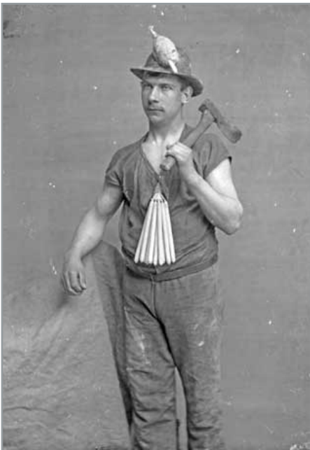
Cornish Miner.

'...the population has decreased since 1871 and emigration is going on and likely to go on to a considerable extent in consequence of the great depression in mining which is the principal service of employment for the inhabitants of St Agnes'