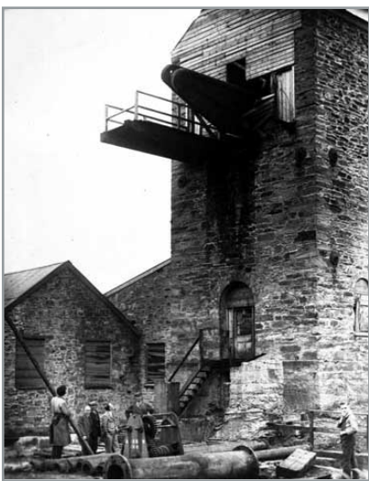
Wheal Kitty.

In the early 19th century, there were lots of small mining operations on this side of St Agnes, but these amalgamated into the larger Penhalls Mine which operated until 1884. In 1904, Wheal Kitty and Penhalls joined forces to become Penhalls United, but the site was last worked as Wheal Kitty (audio track 13).