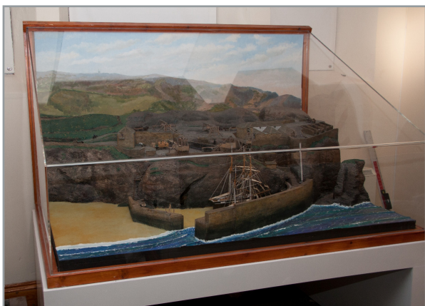
Scale model of harbour.

The engine house was built in 1892 to house a 40 inch pumping engine. Engines were used for three main purposes: the winding or whim engine was for raising ore from the shaft, the stamps engine was for crushing ore and the pumping engine was for clearing water from the mine.