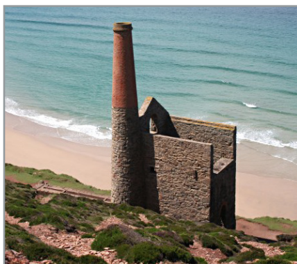
Wheal Coates